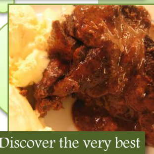
Discover the very best in local produce!