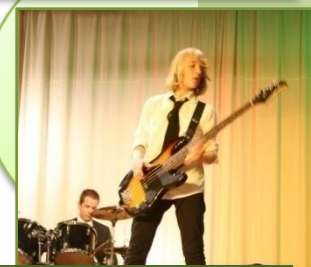
Chill out with live music & cookery shows!