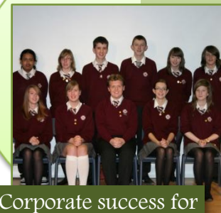
Corporate success for TASTE Longridge!